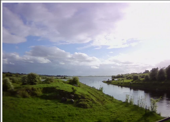
Photo1: Outlet from Lough Gara.