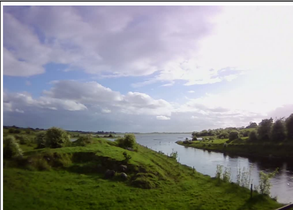
Photo1: Outlet from Lough Gara.